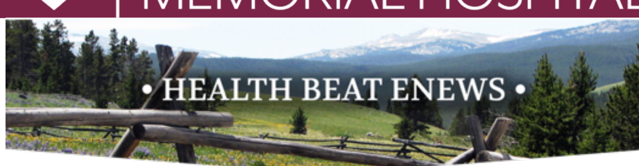
We Stay at Work for You, Please Stay at Home for Us